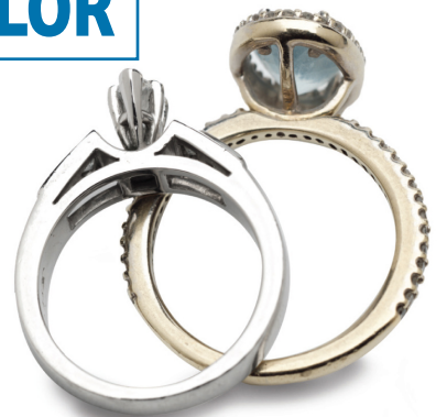
10-Year old platinum ring vs. 2-year old white gold ring

Unlike gold, platinum doesn't change color as it is a naturally white metal. Aside from an occasional polish, there is almost no maintenance involved.